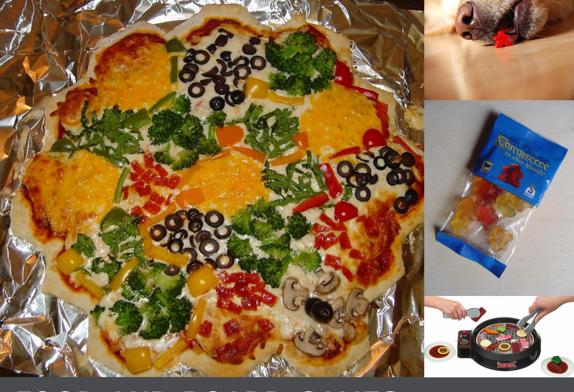
FOOD AND BOARD GAMES